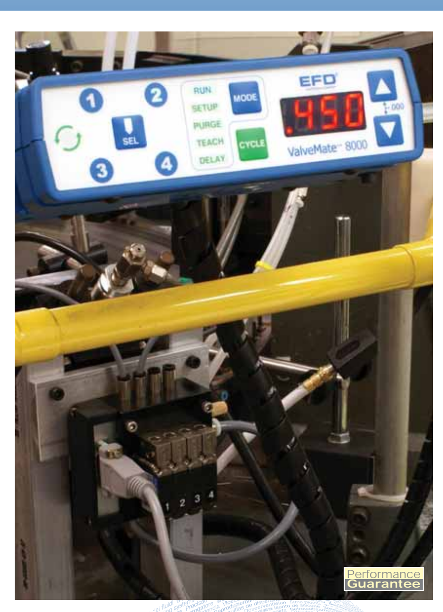
"We had a skilled technician spending 8 to 10 hours a week adjusting equipment. By putting a controller at each dispensing station, we've reduced that time to almost zero."